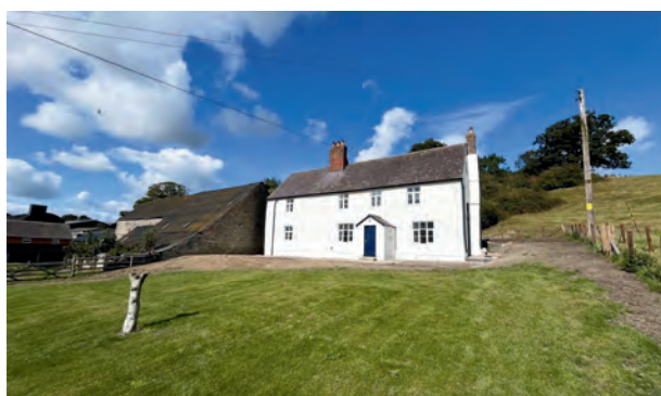
Eyton, Lydbury North Shropshire, SY7 £2,000 PCM

This charming and elegantly renovated three-bedroom cottage offers stunning views, surrounded by the picturesque Shropshire Hills