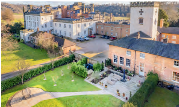
Bridgnorth Shropshire, WV15 Guide Price: £675,000

This striking mews house is nestled within one of Shropshire's most prestigious country estates, offering a picturesque setting.