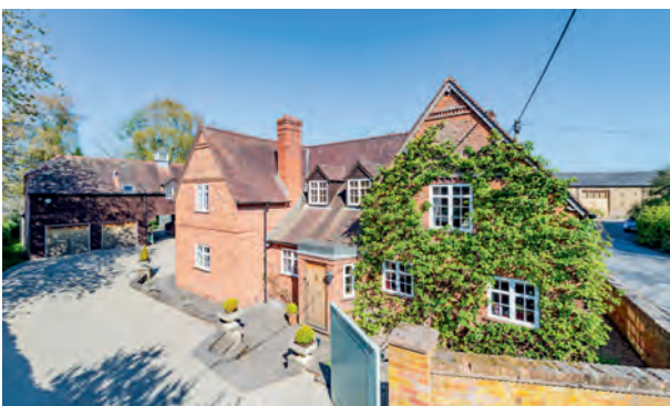
Orleton, Ludlow Shropshire, SY7

A Grade II listed, spacious four-bedroom Georgian house, situated a short distance from Presteigne town centre.