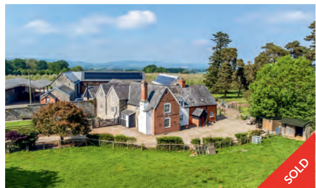
Broxwood Herefordshire, HR5

A unique opportunity to suit multi-generational family living or as a home generating a rental yield, located within the sought-after village of Orleton.