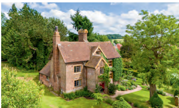
Ludlow Shropshire, SY8 Guide Price: £900,000

An exceptional holiday let business, formerly a family home, nestled in the Welsh hills, with stunning views and a 1.78 Acre (0.72 Ha) paddock.