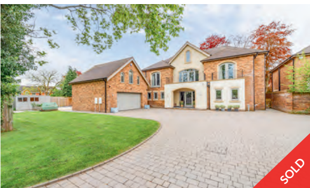
Shrewsbury Shropshire, SY2

A striking stone-built three-bedroom family home, renovated to the highest standard, nestled in a picturesque Hamlet with a rural outlook.