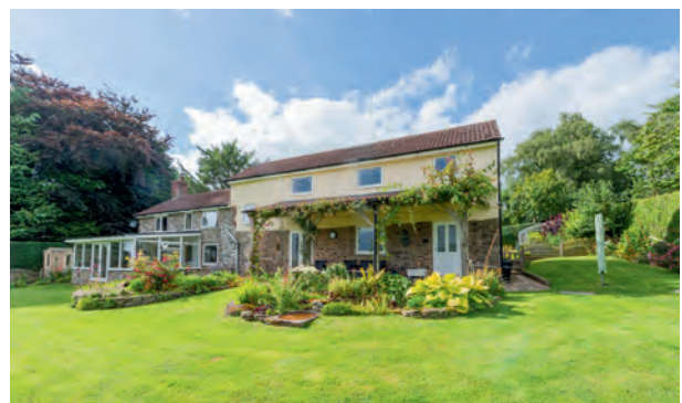
Presteigne Powys, LD8 Guide Price: £625,000

A charming Grade II listed 17th century farmhouse with a large garden set on the outskirts of historic Ludlow.