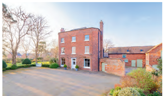
Dorrington Shropshire, SY5

Arguably the finest new build residence in South Shrewsbury. This utterly striking home exudes style and charm, through design and accommodation.