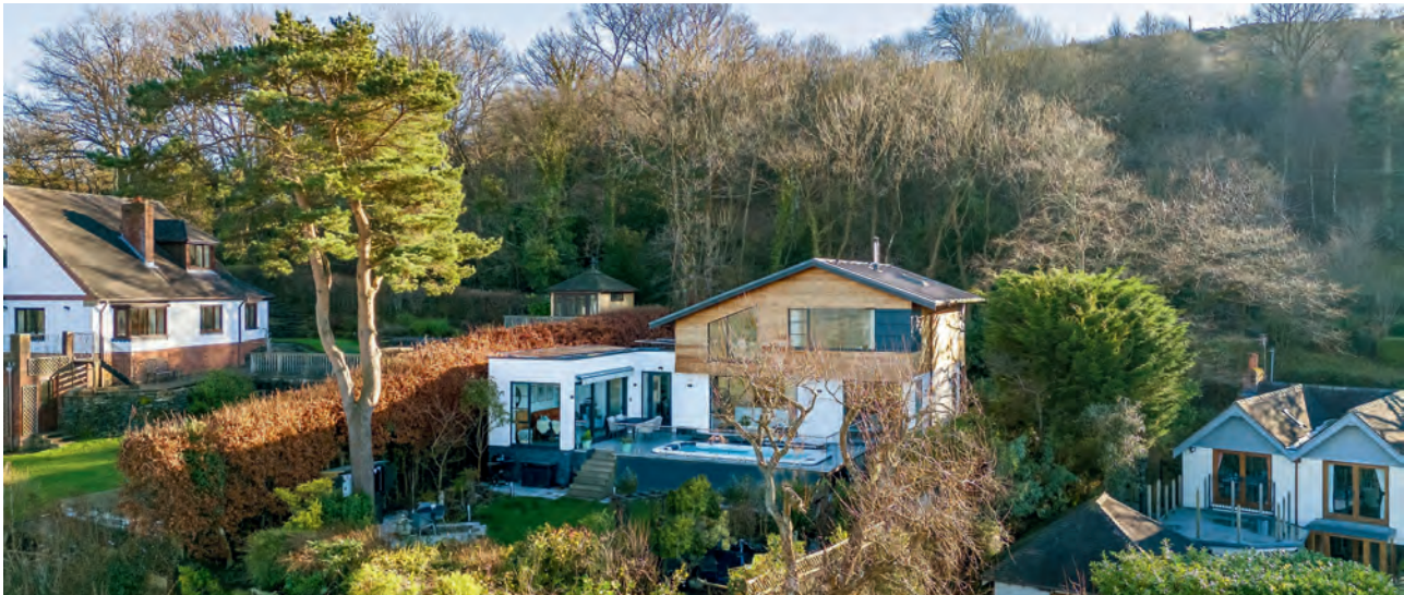
Church Stretton Shropshire, SY6