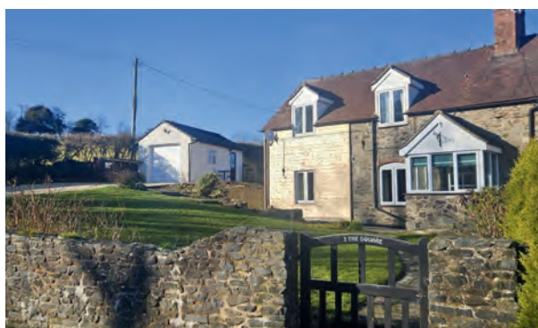
All Stretton, Church Stretton Shropshire, SY6 £1,200 PCM

A spacious five bedroom Georgian terraced house within fifteen minutes walking distance to Ludlow town centre.