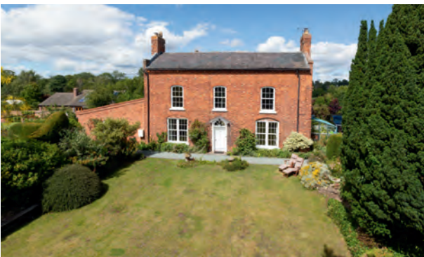
Cruckmeole Shropshire, SY5

A truly exceptional six-bedroom 17th century country home in the hamlet of Leaton, on the outskirts of Shrewsbury, complemented by attractive gardens and woodland. Originally dating back to the 17th century as a Coaching Inn, and impeccably presented, it blends timeless elegance with practicality and contemporary finishings, offering spacious family living alongside sophisticated reception rooms perfect for entertaining.