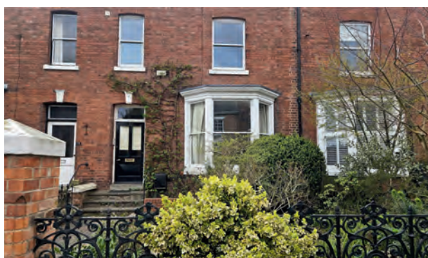
Ludlow Shropshire, SY8 £1,700 PCM

A spacious five bedroom Georgian terraced house within fifteen minutes walking distance to Ludlow town centre.