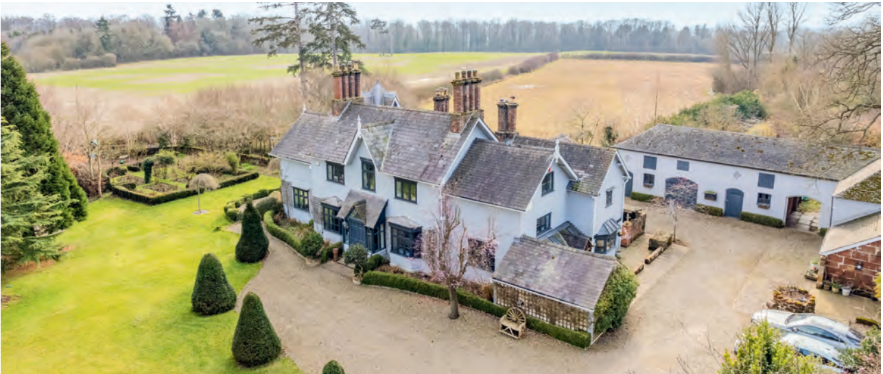
Leaton, Shrewsbury Shropshire, SY4