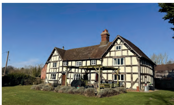
Sidbury, Bridgnorth Shropshire, WV16 £1,800 PCM

A newly renovated Grade II listed five-bedroom farmhouse situated in an elevated position with views over the Shropshire Hills.