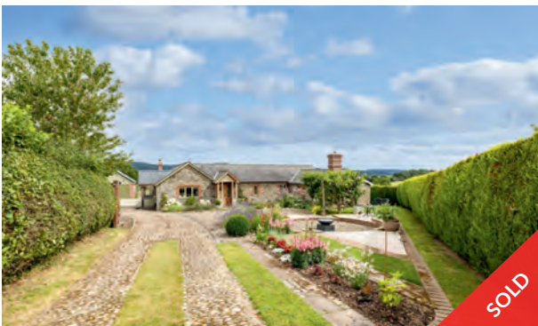
Craven Arms Shropshire, SY7

Tamiko is a contemporary four-bedroom house which has been completely renovated by the current owners, perfect for modern day family living and entertaining. There is a real wow factor to this architecturally designed home, with a Swim Spa Pool and Jacuzzi on the terrace encompassing arguably one of the best views in Shropshire.