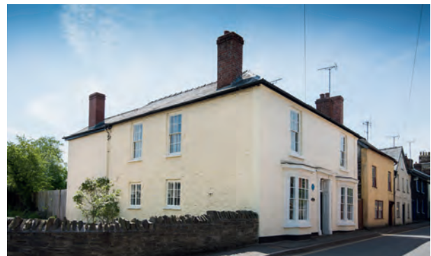
Presteigne Powys, LD8

A charming four-bedroom home with double garage and outbuildings, set in 2 acres (0.80ha) of gardens, orchards and pasture with stunning views.