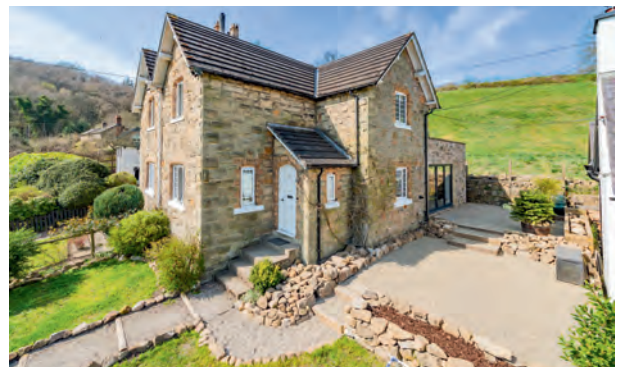
Oswestry Shropshire, SY10

A Grade II listed house set in delightful south west facing gardens, extensively refurbished yet retaining original features and character.