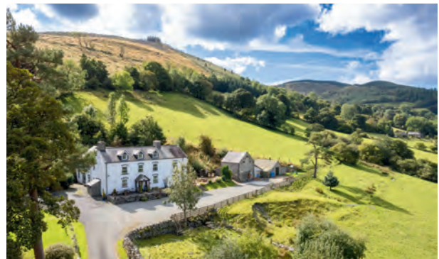
Llangynog Powys, SY1 Guide Price: £1,100,000

This striking mews house is nestled within one of Shropshire's most prestigious country estates, offering a picturesque setting.